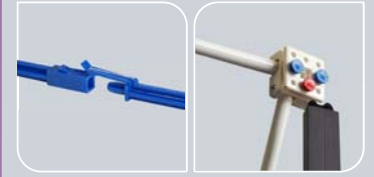
molded frame lockers hinged channel bars

Compact Pop-up Exhibits provide maximum portability. A standard 10' backwall with lights and case-to-counter conversion will pack into one UPS-able wheeled case. The pop-up frame is a sturdy support for products or graphics. The frame also offers molded frame lockers and a 3-piece hinged channel bar means you will have less pieces to assemble/disassemble. Both straight and curved frames can be integrated into one exhibit which creates endless possibilities.